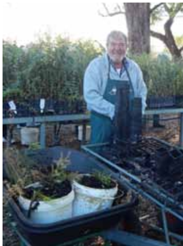
Greening Australia 2014