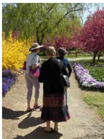
Outing to Tulip Tops farm