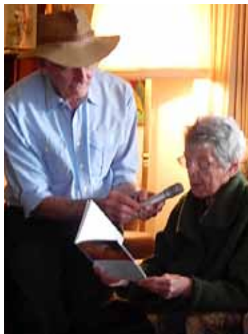
Dementia Awareness Month September 2013