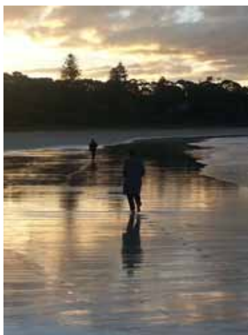
Weekend to Murramarang August 2014