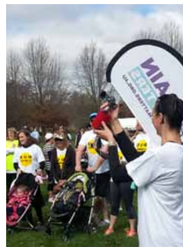
Memory Walk & Jog September 2014