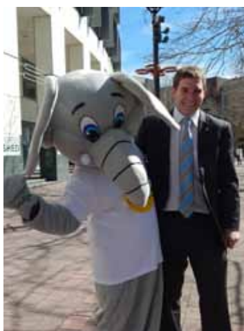
At the Elephant raising awareness September 2014