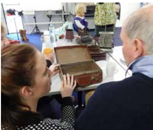
Reminiscing with Memory Boxes from Calthorpes House