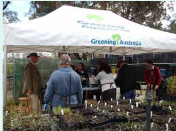
Major General the Hon. Michael Jeffery visits Greening Australia and talks to the YOD group

Memory Lane Café is a monthly meeting group established for people living with younger onset dementia and their families to develop friendships, support and social engagement in an iconic setting. Every month members meet for morning tea at Poppy's Café at the Australian War Memorial to catch up, share what's happening in their lives and to just enjoy being together.