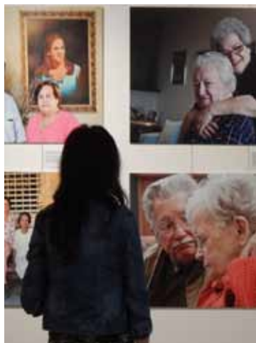
Love, Loss and Laughter Art Exhibition July 2013