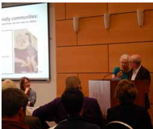
Alzheimer's ACT Members speak during Dementia Awareness Month 2013