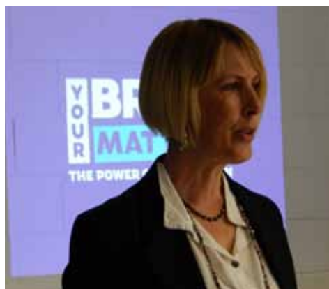
Your Brain Matters Presentation