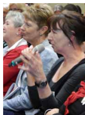
Dementia-friendly Communities presentation Dementia Awareness Month 2014