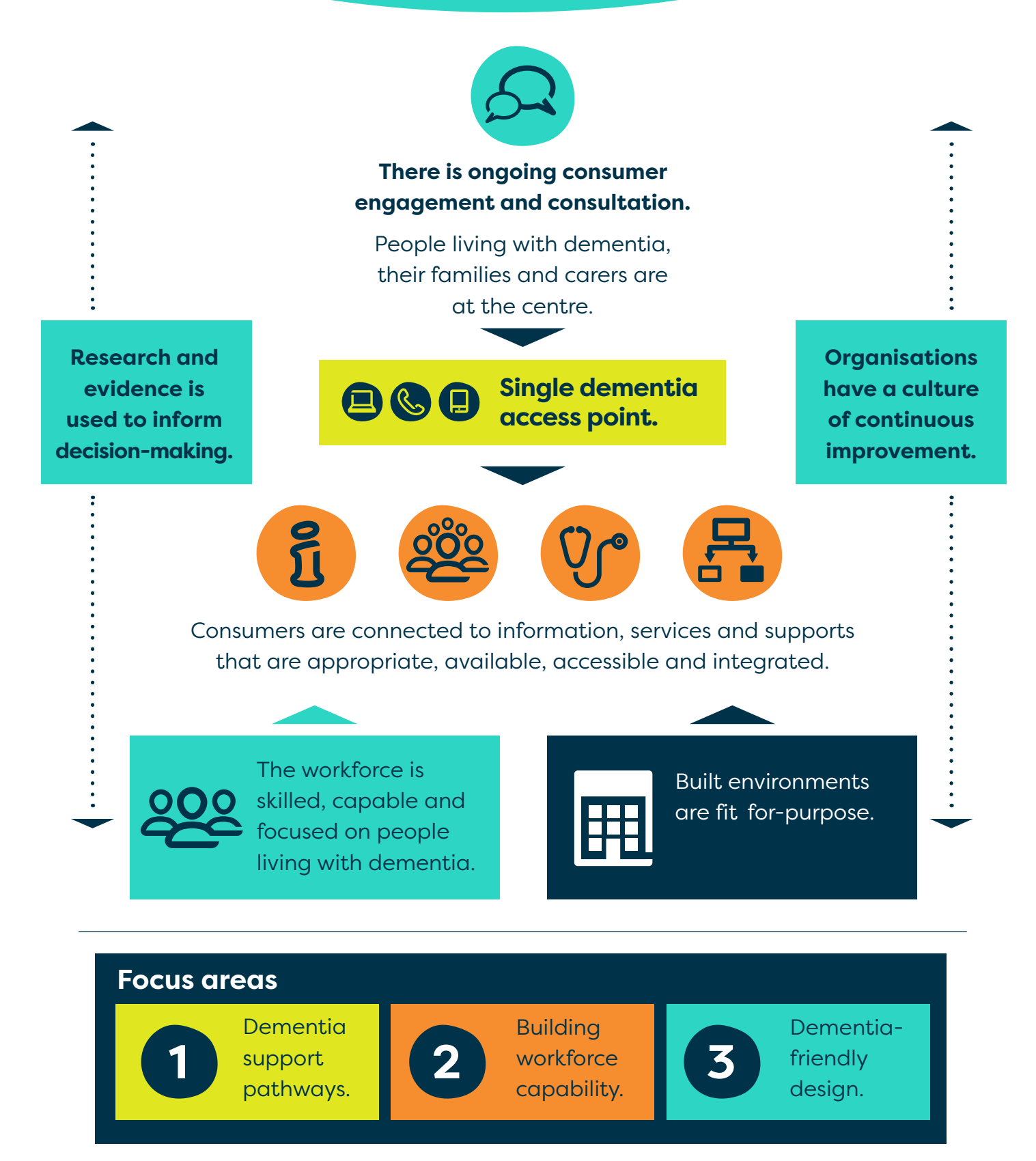
Figure 2: Quality Dementia Care Roadmap