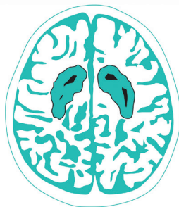
Reduced brain activity of drug addiction

The mode of action of many drugs is to target the mesolimbic dopamine reward system. For example, some drugs promote dopamine release in the nucleus acumbens. Whilst there can be variable results across individuals, the strength of the dopamine signal usually correlates to the risk for addiction. Some drugs are more highly addictive than others because of their aggressive targeting of dopamine availability within this reward system.