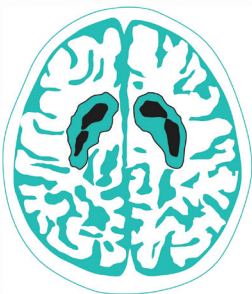
Normal brain activity

Cumulative effects can result in persistent or permanent changes in the brain and it is these changes that can influence the risk of developing a dementia.