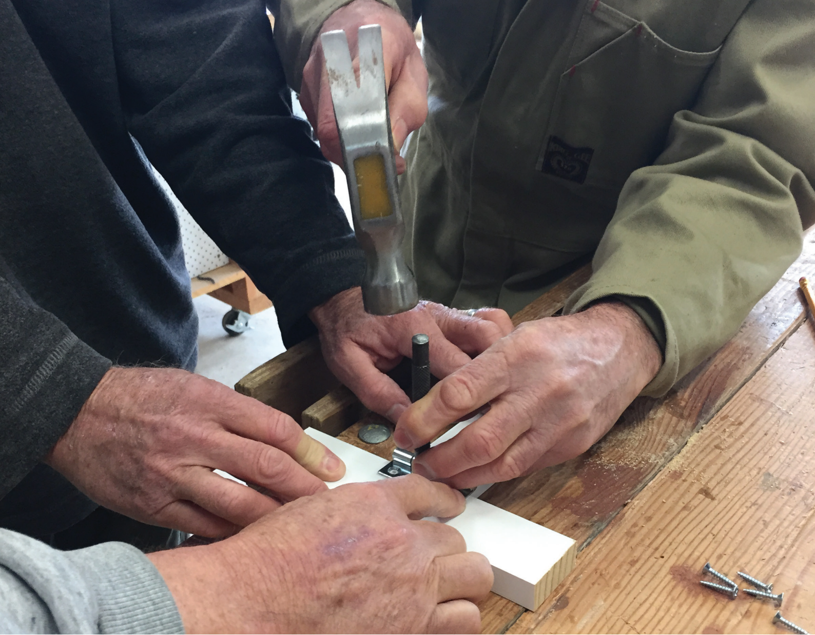
Pictured above woodworking participants creating new products for our social enterprise.