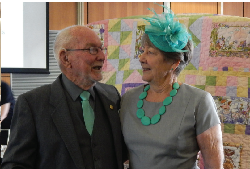
Women in Racing Fundraiser November 2015