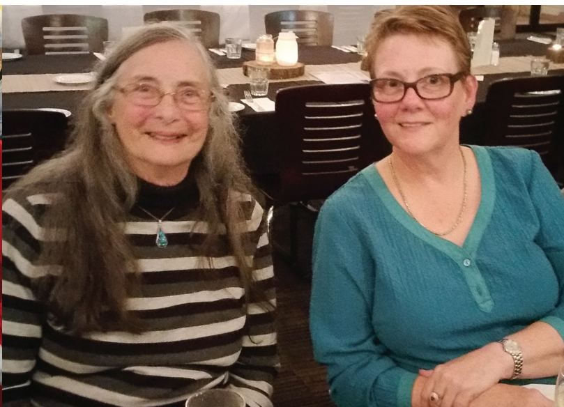
Murramarang Trip - March 2016