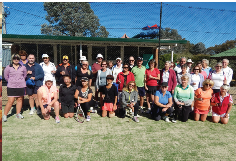
ACT Tennis Charity Day for Alzheimer's Australia ACT May 2016