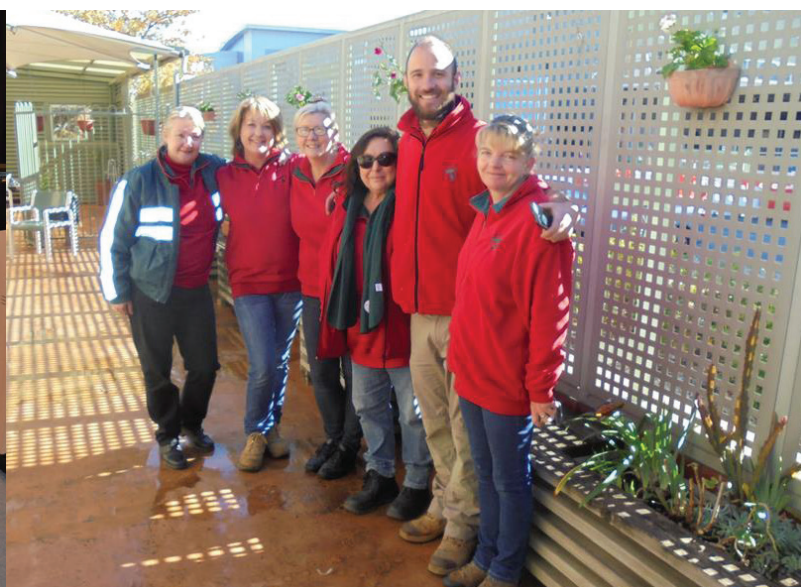
Dementia Friendly Garden - The Canberra Hospital June 2016