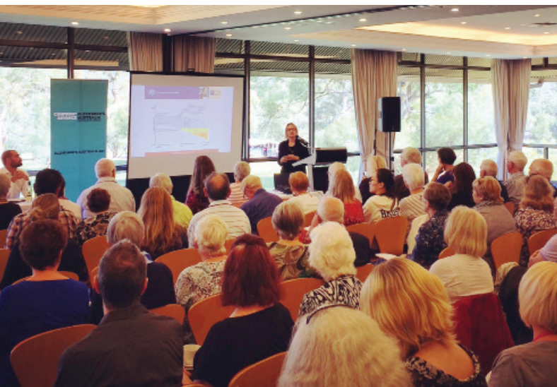
Advances in Dementia The Latest Science March 2016