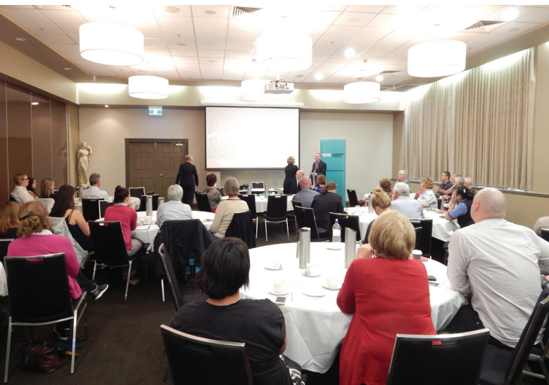
Dementia Design and the Environment - November 2015