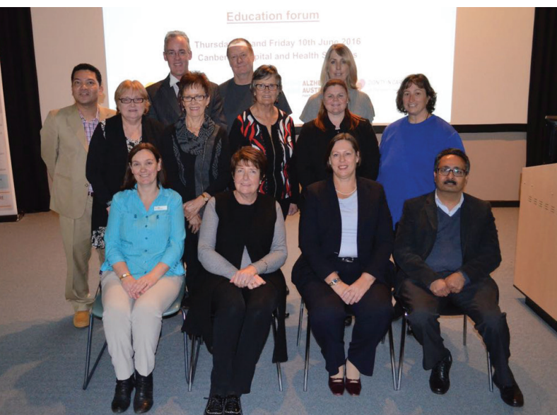
DBMAS ACT - The Canberra Hospital Workshop June 2016