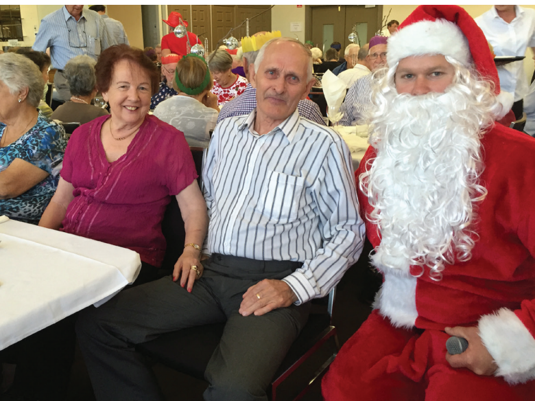
Client's and Member's Christmas Party - December 2015